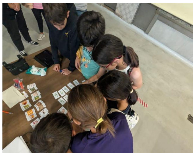
FIGURE 2. A group of Children playing the AF4EU MEMO-GAME learning concepts about sustainability and agroforestry systems, during Galician G-NIGHT in Lugo, Spain. Couso, A.