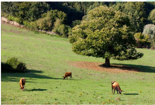
Figure 1. Autochthonous Breeds Galician Federation - BOAGA

The use of local breeds with local resources and more specifically silvopastoral, make them special because they are the only ones that manage to take advantage of them and obtain high quality products. The diet of these races in Galicia is based on 90% in breast milk, since they are maternal races, and in turn they feed on the resources at their disposal because they are environmental races.