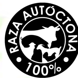
Figure 2. Spanish Ministry of Agriculture, Fisheries and Food

It is important to achieve greater implementation of agroforestry systems and to publicize their environmental work among all sectors. These systems with adequate technical management, where native races play a fundamental role given their rusticity and adaptation to their specific environments, will generate great environmental, economic and social advantages.