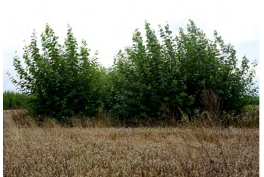
Close-up of poplar hedgerow with winter wheat. Ref : Mirck, 2016

Many crops that are protected by hedgerows of fast growing trees, managed as short rotation coppice, demonstrate increased photosynthetic rates and water use efficiency.