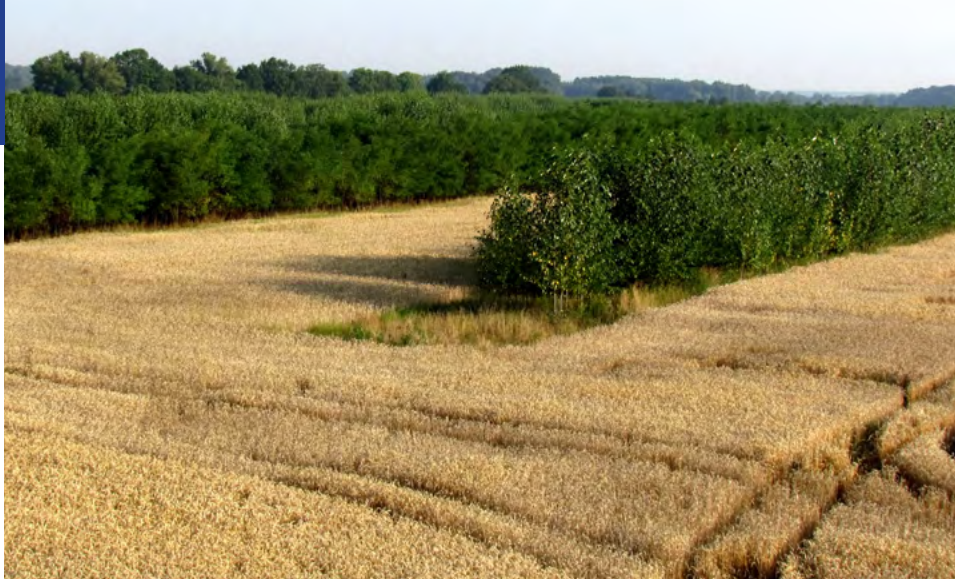
Winter wheat within poplar and black locust alley cropping system. Ref : Freese 2014