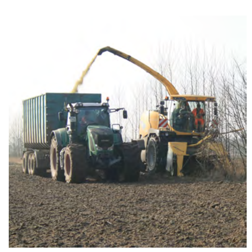
Mechanical harvest of tree hedgerows of the alley cropping system. Ref : Kanzler , 2015