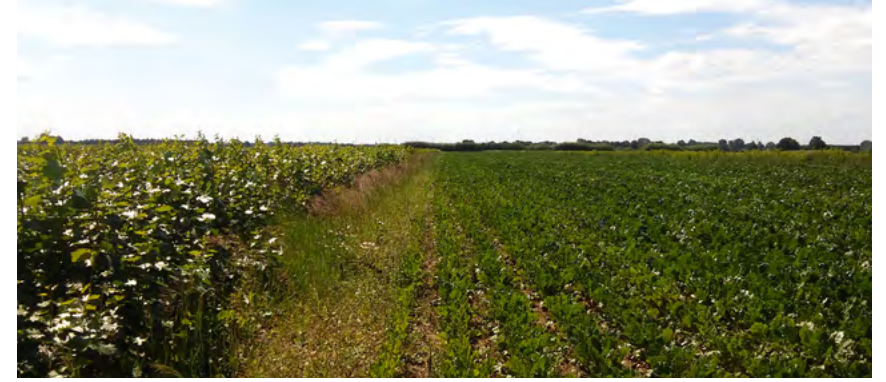
Sugar beet within poplar and black locust alley cropping system. Ref : Mirck, 2015

Tree hedgerows can vary in width between 2 and 10 rows (2-15 m wide). Both single and double row designs can be used. Spacing for a single row design could be 2.55 m between rows and 0.4 m within the row. For a double row design, there should be 1.75 m between double rows, 0.75 m within the double row and 0.9 m within the row. The crop alley spacing can vary between 24 and 96 m.